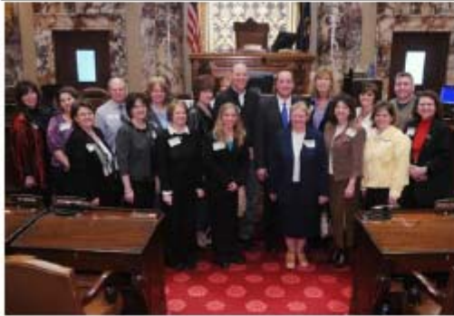
2008-2009 Participants at the Business Day at the Capital

Dynamic Development of Community Leaders