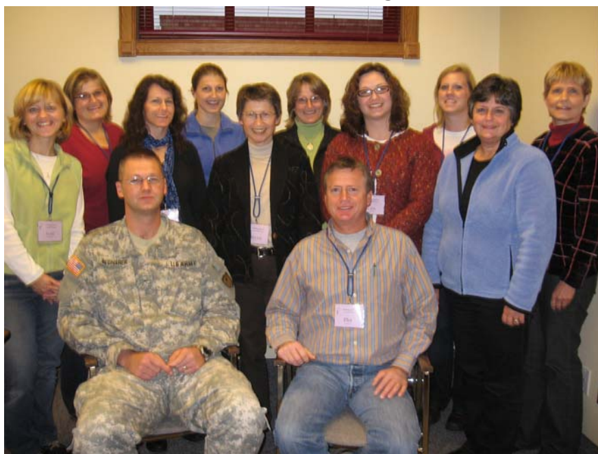
2009-2010 Leadership LindyLand Participants